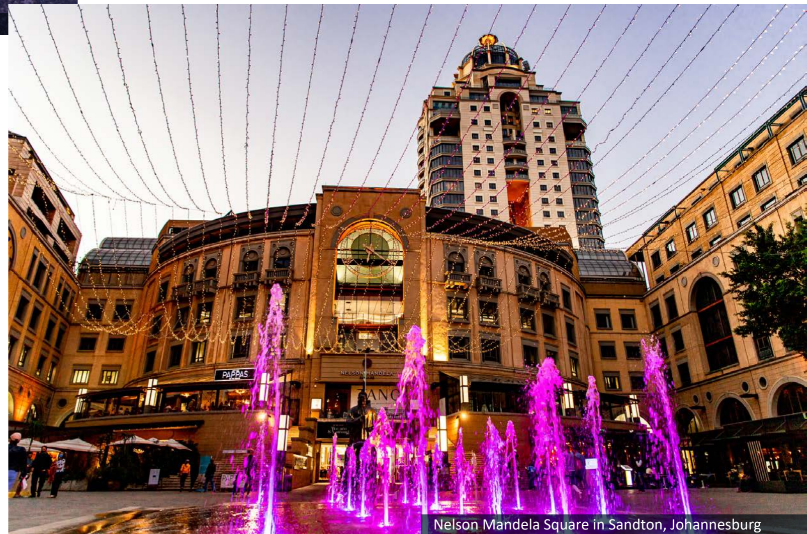
Nelson Mandela Square in Sandton, Johannesburg