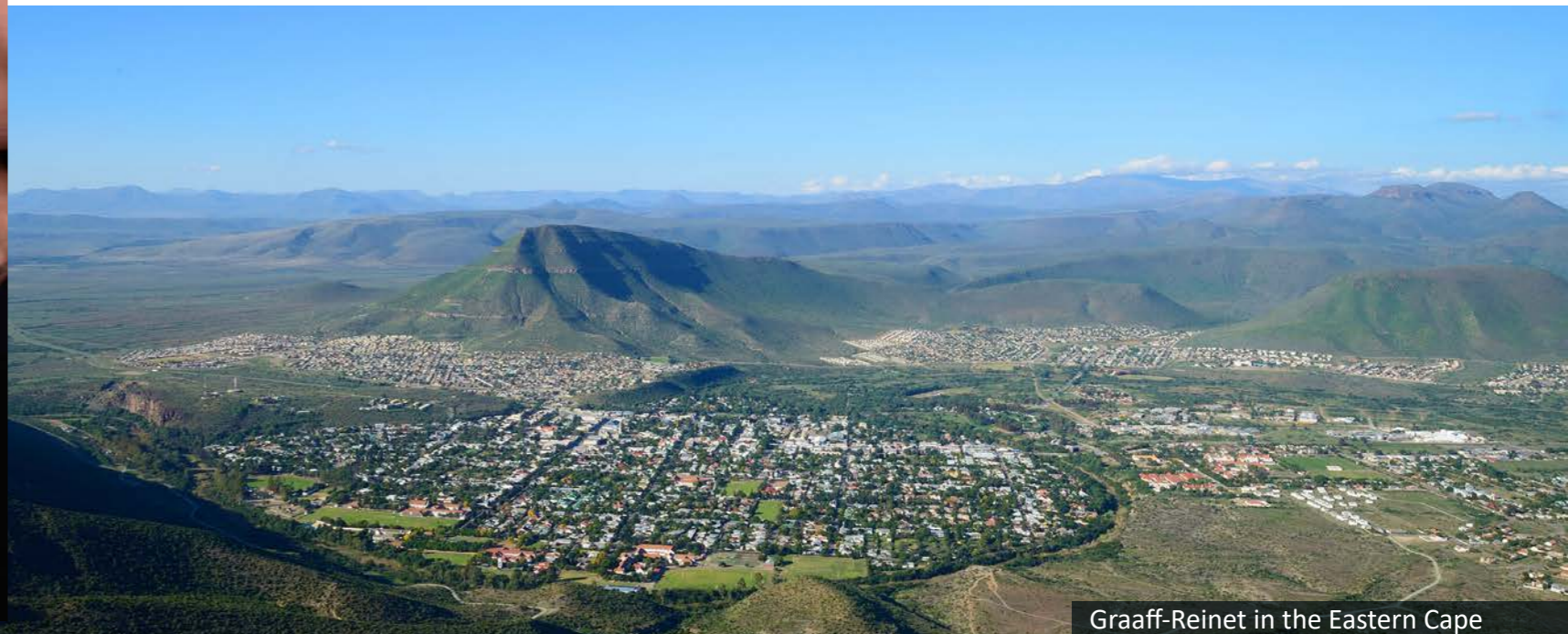
Graaff-Reinet in the Eastern Cape

I did a BCom at Stellenbosch – and I loved it. In 1999, I started working in Nelspruit as a Financial Controller at Riverside Mall. This was a hands-on opportunity to learn all about the disciplines of retail management which I believe firmly cemented and prepared me for the growth that was to come in my career.